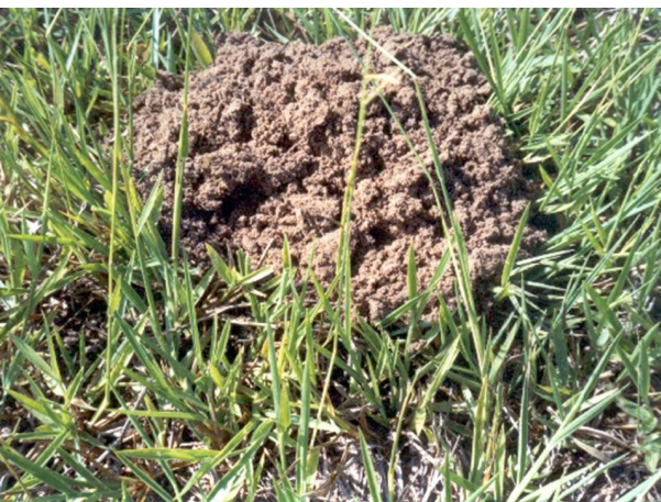
FIGURE 7- (FPMAM89PH) Southern Naked-tailed Armadillo Cabassous unicinctus . Stage 4 in burrowing process. Estancia Pa'í Kuára, Departamento Amambay, January 2006.