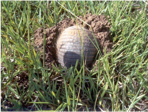
FIGURE 5- (FPMAM87PH) Southern Naked-tailed Armadillo Cabassous unicinctus . Stage 2 in burrowing process. Estancia Pa'í Kuára, Departamento Amambay, January 2006.