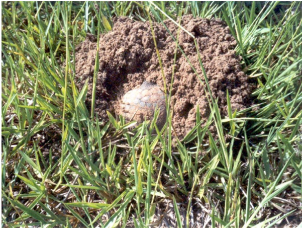
FIGURE 6- (FPMAM88PH) Southern Naked-tailed Armadillo Cabassous unicinctus . Stage 3 in burrowing process. Estancia Pa'í Kuára, Departamento Amambay, January 2006.