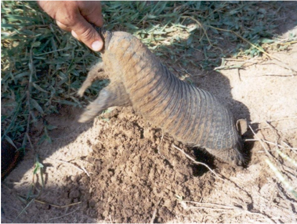
FIGURE 2- (FPMAM60PH) Southern Naked-tailed Armadillo Cabassous unicinctus . Adult frontal view. Estancia Pa'í Kuára, Departamento Amambay, January 2006.