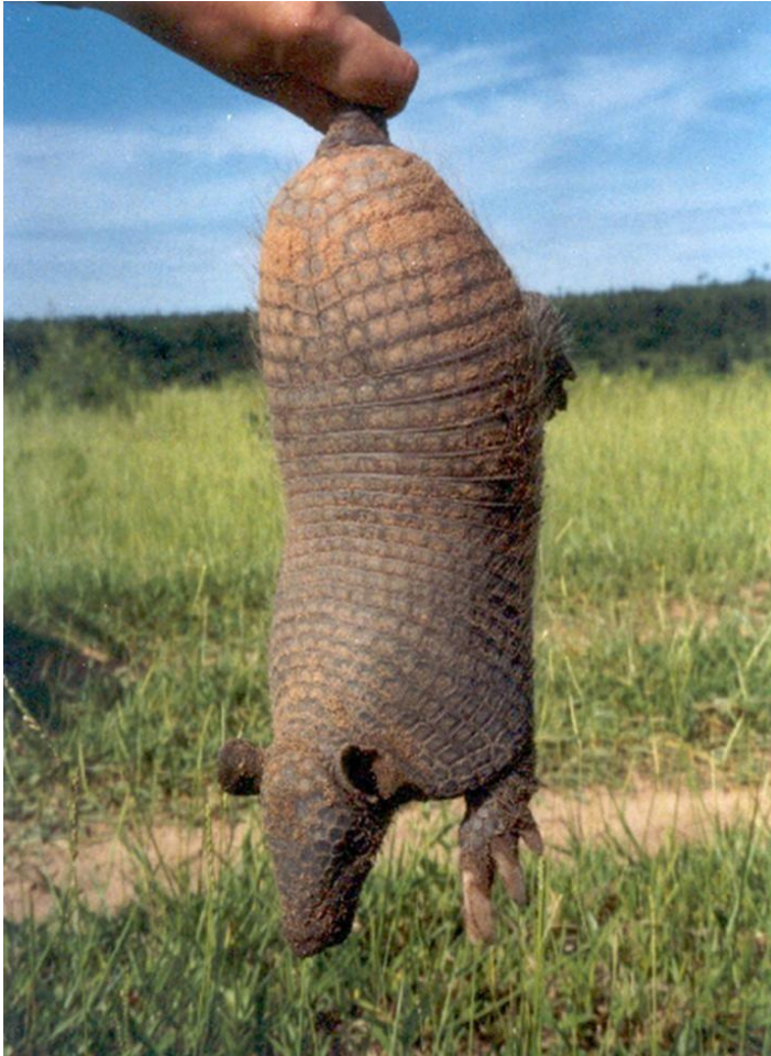
FIGURE 1 - Adult dorsal view. Estancia Pa'í Kuára, Departamento Amambay, January 2006. (Photo Hugo del Castillo).

TAXONOMY: Class Mammalia; Subclass Theria; Infraclass Eutheria; Order Cingulata; Family Dasypodidae; Subfamily Tolypeutinae; Tribe Priodontini (Myers et al 2006). The genus Cabassous was defined by McMurtrie (1831) and contains four species, three of which are present in Paraguay. The genus was reviewed by Wetzel (1980). There are two quite distinct subspecies, one of which, C.u.squamicaudis , is present in Paraguay (Wetzel 1980). It is possible that these two subspecies in fact represent distinct species, with the divergence between them in morphology and other characters of taxonomic importance greater than or equal to differences between C.u.unicinctus and other species in many cases. Wetzel (1980) retained them as subspecies presumably on the basis of a reported zone of intergradation in the Amazon River area, though the intergradation of two closely related but distinct species in a zone of overlap may not be completely out of the question.