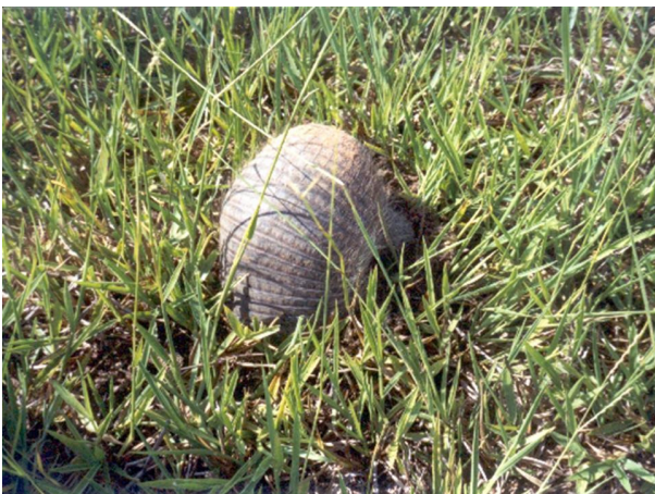
FIGURE 4- (FPMAM86PH) Southern Naked-tailed Armadillo Cabassous unicinctus . Stage 1 in burrowing process. Estancia Pa'í Kuára, Departamento Amambay, January 2006.