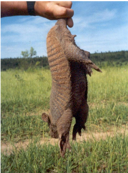
FIGURE 3- (FPMAM85PH) Southern Naked-tailed Armadillo Cabassous unicinctus . Adult lateral view. Estancia Pa'í Kuára, Departamento Amambay, January 2006.